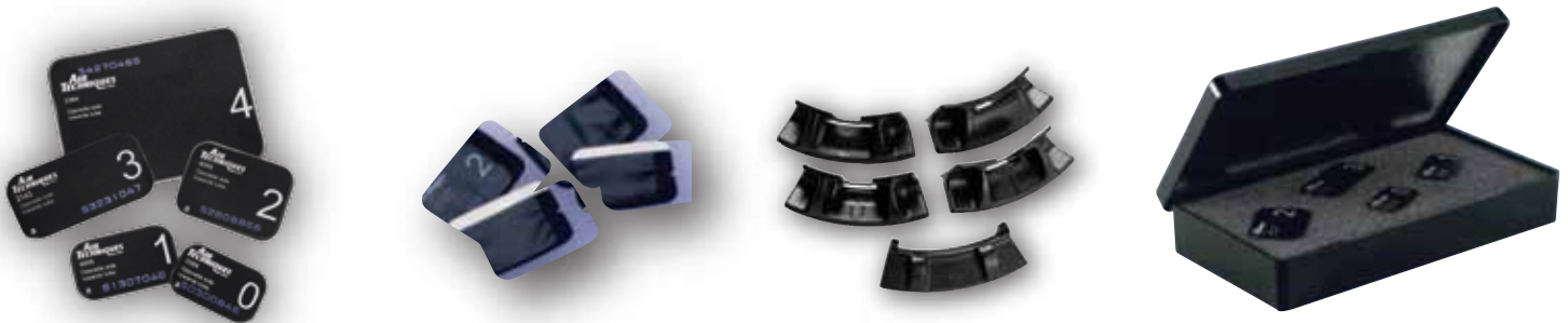
From left to right: Phosphor Storage Plates, Barrier Envelopes, Plate Guides, Plate Transfer Box

Understanding this, we at M.A.S. Medical with Allpro Imaging have established two basic maintenance kits that will help ensure continuous operation of the ScanX Digital Imaging System. Please give us a call for more details.