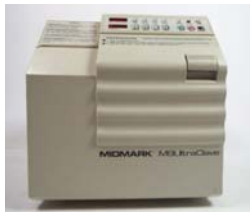
Midmark M9 AutoClave Refurbished Five (5) year warranty protection Only 2 available. $3895.50 each

NEW MODEL!! An improved features and functions of the ART-M3 Scaler, this system has our unique "AGC" (Auto Gain Control), and an LCD digital display screen that shows scaling mode and power setting.