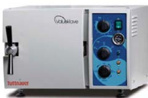
Tuttnauer ValueKlave Steam Autoclave Refurbished Five (5) year warranty protection Starting at $2995.50 Ideal for Veterinary instruments. Comes with 3 trays. 10" x 19" chamber.

Manufacturer refurbished, ideal for Veterinary clinics, equine hospitals and small hospitals. Magna-Clave features a 15" x 26" chamber to handle larger autoclave loads. Comes with its own stand.