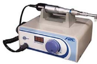
Art-PL3 Polisher Unit w/ E-type Micromotor (For Veterinary use only) Part# MAS-PL3 Retail $1350.00

State of the art radio frequency electrosurgical unit proudly manufactured and offered by Bonart. Unit is comparable to major brands. Great quality and economical. One of the best selling and most products of Bonart.