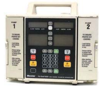
Infusion Pump / Refurbished Five (5) year warranty protection $1050.50 each