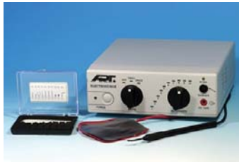
ART-E1 Electrosurgery / Cutting Unit With 7 Pc. Electrodes Part# MAS-E1 Retail $1450.00

State of the art radio frequency electrosurgical unit proudly manufactured and offered by Bonart. Unit is comparable to major brands. Great quality and economical. One of the best selling and most products of Bonart.