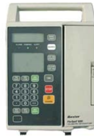
Baxter Flo-Guard 6201 Infusion Pump / Refurbished Five (5) year warranty protection $995.00 each

Designed to provide maximum capacity, speed, simplicity, reliability and efficiency, Midmark sterilizers offer everything you need for veterinary use.