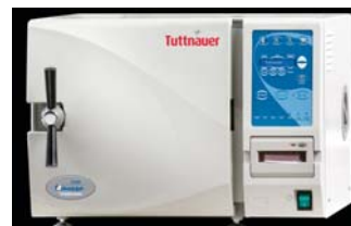
Tuttnauer 2540E | 2540M | 2340M Steam Autoclave Refurbished Five (5) year warranty protection Starting at $3350.00 Ideal for Veterinary instruments. Comes with 3 trays. 10" x 19" chamber.