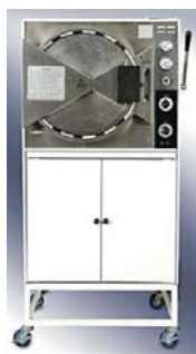
Pelton & Crane Magna-Clave Refurbished Five (5) year warranty protection Only 2 available. $5895.00 each

Manufacturer refurbished, ideal for Veterinary clinics, equine hospitals and small hospitals. Magna-Clave features a 15" x 26" chamber to handle larger autoclave loads. Comes with its own stand.