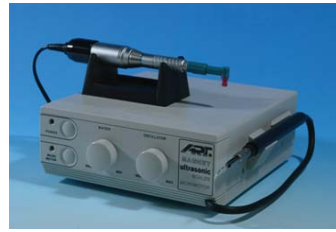
ART-SP1 Scale Polisher Combo Unit Part# MAS-SP1 Retail $1950.00 Part# MAS-SP2 Retail $2150.00 (piezo)

Newly redesigned ART-PL3 electric polisher system; lightweight and compact, stylish and modern look, yet provides powerful polishing performance.