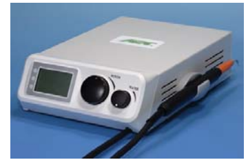
ART-M3 (UPGRADED SERIES) Ultrasonic Scaler Part# MAS-M3 Retail $1350.00

This combo unit provides the ease of use in scaling performance and polishing function. No need for 2 individual units to perform each operation.